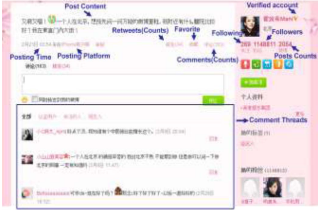
Fig. 1. Layout of Weibo replying

In order to keep our classification in this work meaningful, we manually reclassified all posts with the returned categories of “Region” and “Unknown”. Besides, we merged two categories “Computer/ Network” and “Electronics” given that questions in those two categories could not be distinguished reliably even with human taggers. In total, six major categories were selected based on our dataset, which includes “Healthcare”, “Business”, “Entertainment”, “Education”, “Life” and “Technology”.